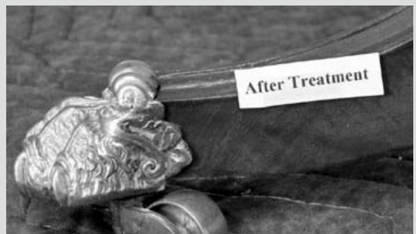
Before and after photos of a repair by Linda Coit to the broken foot of the pietra dura table in the parlor at Woodlawn.